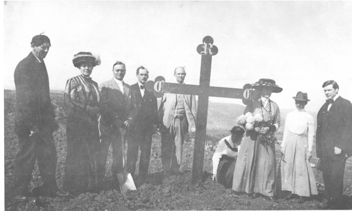
62. The planting of the cross in 1911.

“Deceit and illusion cannot be allowed to endure forever, and so the redeemer appeared to cleanse the passion-filled blood, to preach the truth which shall set us free from this body of death, to inaugurate the immaculate conception along lines most crudely indicated in the science of eugenics, to prophesy a new age, a new heaven, and a new earth, of which He, the true lights, will be the Genius, an age wherein will dwell the righteousness and love for which all the world is sighing and seeking.