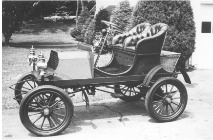
60. A Franklin 1903 model.

o'clock the back of the car was filled to overflowing with typewriters and suitcases and the Heindels were ready to depart for Oceanside.