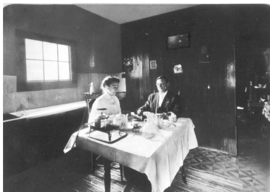
59. Dining room-kitchen in Ocean-Park, 1911.

During this period, the Rosicrucian Fellowship was called: “An International Association of Christian Mystics” and the motto: “a sane mind, a soft heart and a sound body” was introduced.