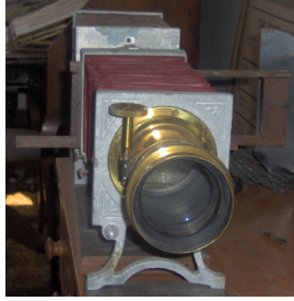
54. The stereopticon.

Armed with tacks, a hammer and a big armful of 8-inch by 10-inch advertising cards, he walked miles each day to tack up the cards where they would catch the eye of the public. He wrote his own newspaper reviews and took them to publishers, who were sometimes very prejudiced against the new Teachings, but his attractive personality often overcame their aversion and they would finally give him a whole page.