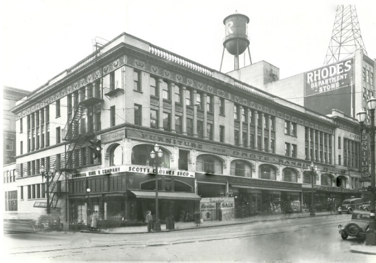
55. Arcade building, Seattle, 1932.