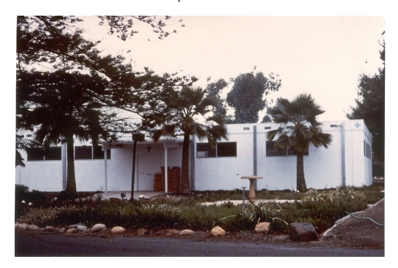
100. The Shipping Department, 1976.

"The city has requested that we install six inch water mains to provide better fire protection. This, of course, we are happy to do. A new main entrance has also been decided upon.