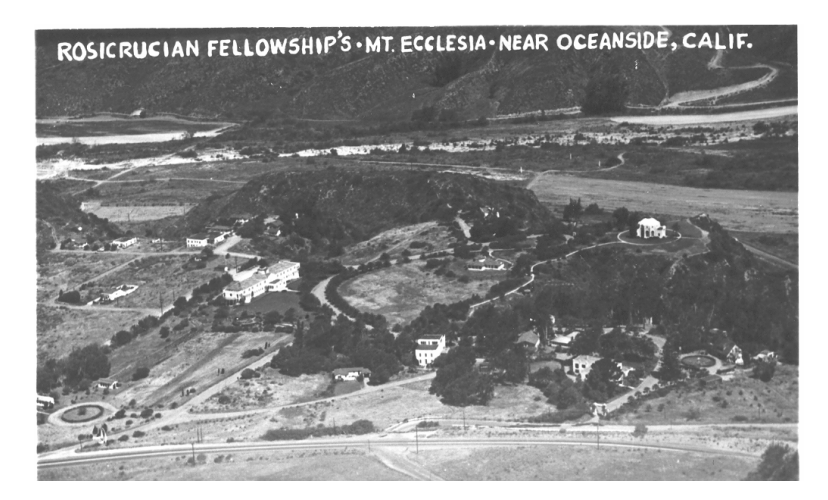
101. Aerial picture of Mount Ecclesia.

Mount Ecclesia lies about 3½ km or 2¼ miles east of downtown Oceanside. From the train station one goes a couple of blocks to find Mission Avenue, which runs right past the Fellowship. In front of Headquarters is a split. The old original Mission Avenue is now called Amick Street. From the original main entrance, the road along the illuminated emblem, the Pro-Ecclesia and the Guest House. Beyond the Guest House, Temple Drive loops around by the Healing Department. Between Ecclesia Drive and Temple Drive where cottages are clustered in a row is Melody Lane. Max Heindel planted the pine tree opposite 10 and 12 in 1911.