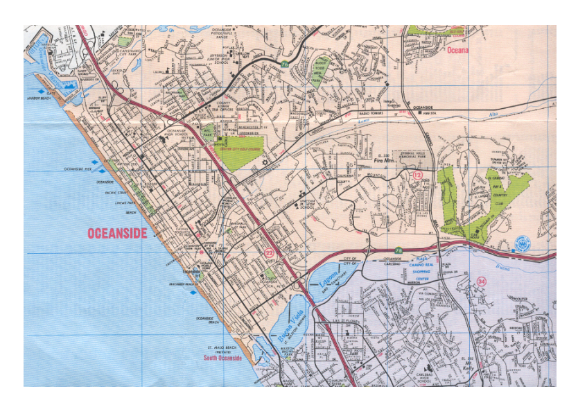
102. Map of Oceanside.

On the map of Oceanside, picture 95, you see a bold line near the top, running from left to right; that is highway 76. Mount Ecclesia is located north of that bend in Mission Avenue where the curve goes downward.