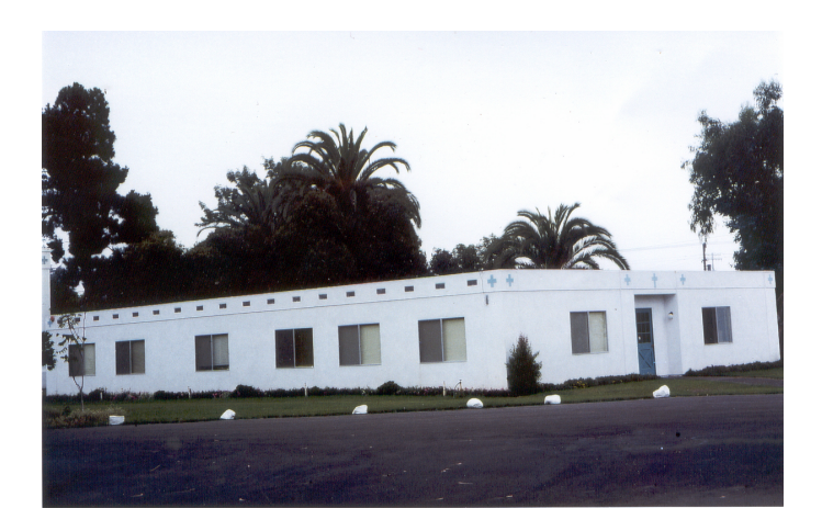
99. The New Administration Building, 1975.

"Every inch of the ground has been planned so that future development will be orderly and aesthetically pleasing. The plan will be implemented over the next ten to fifteen years.