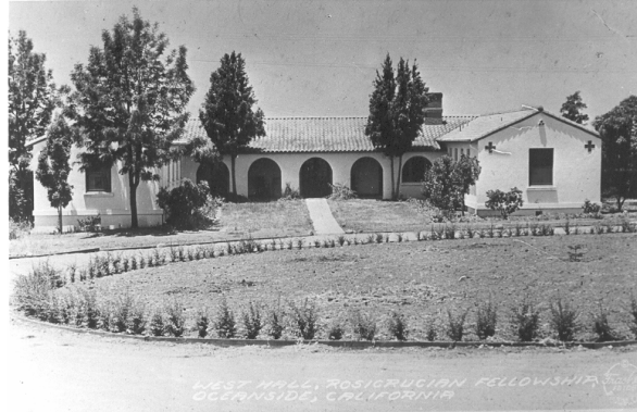
86. The Children's School, later named West Hall.