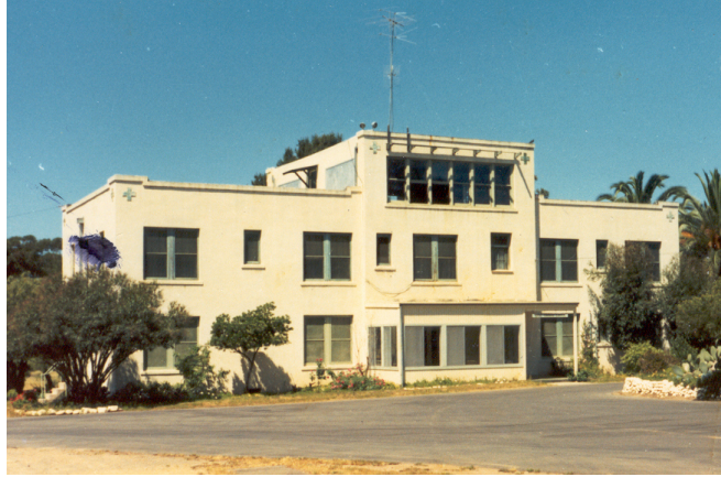
85. Rose Cross Lodge.

At about this time a number of improvements made life easier at Mount Ecclesia. The highway that passed the grounds was paved. The San Diego Gas & Electric Company began to supply Mount Ecclesia with electricity and gas, so the water, gas and electric troubles belonged to the past. Even the ice company, the grocer and the baker offered delivery to Headquarters.