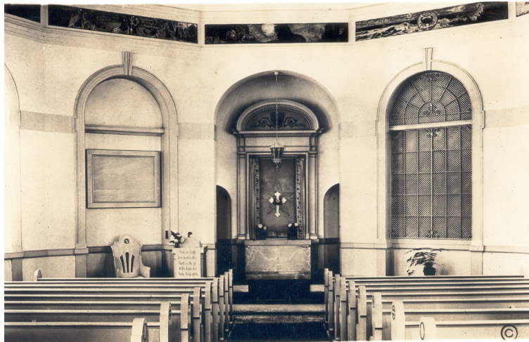
84. Interior of the Healing Temple.