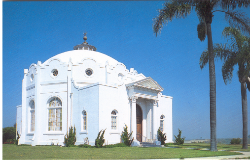
82. The Healing Temple or Ecclesia.

At exactly twelve o'clock, following Mrs Heindel's speech, the disciples, probationers, and students each turned a spade full of earth. Then Mrs Heindel spoke of the building of the true Temple of Healing where the physical symbol, the Ecclesia, was about to be established.